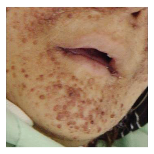
Figure 1. Brown to black papules on her face

The disease occurs in 4-5: 100,000 persons. Each of the 2 genes responsible for the disease is able to reveal all its