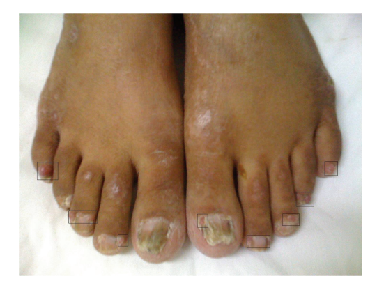
Figure 4. Nail hyperkeratosis and several soft pink nodules and papules around the nails of her hands and feet