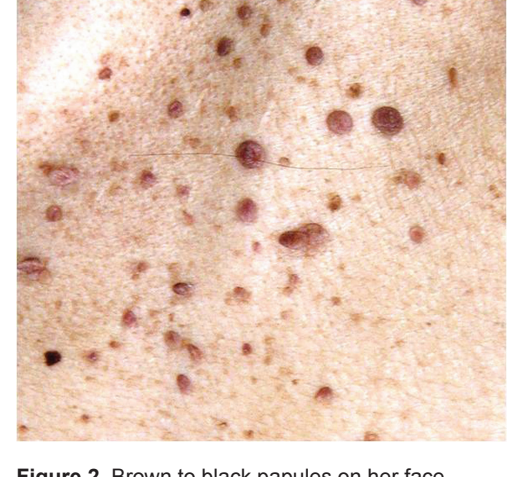
Figure 2. Brown to black papules on her face