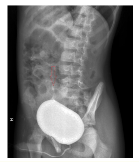
Figure 2. Voiding cystourethrography (VCUG) of the patient: grade II vesicoureteral reflux (VUR) in right kidney with normal bladder and urethra.

in pelvic region (Figure 2). Voiding cystoureterogram (VCUG) was performed to rule out association with vesicoureteral reflux (VUR). It showed grade II right sided VUR with normal bladder and urethra (Figure 3).