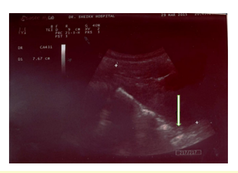
Figure 1. Abdominal ultrasonography which demonstrated right kidney in pelvis cavity with no kidney tissue in left side.