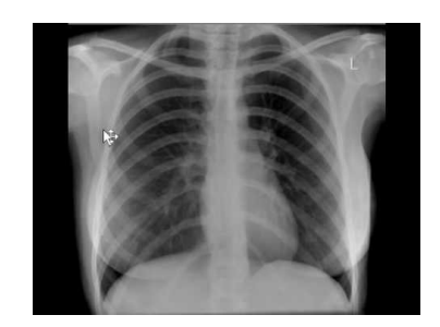
Figure 2. X-ray chest posteroanterior (PA) view showing mild bilateral patchy consolidation especially in hilum.

The electrocardiogram (ECG) was normal. 2D echocardiography showed normal cardiac chambers with LVEF of 70%. Based on the typical poison-associated symptoms in the mouth and the gastrointestinal tract, computed tomography (CT) manifestations, significantly abnormal results in the main laboratory test results and the information provided by the patient and his relatives on admission, the patient was diagnosed with acute paraquat poisoning. Following admission to the hospital, other treatments such as an Ventolin nebulizer and also becotide spray, the patient was received antibiotic during admission including clindamycin 500 mg/TDS, cloxacillin 1 gm/QID, ceftriaxone 1.5 gm/BD and also pantoprazole 40 mg/TDS. The physician prescribed also drop nystatin for the oral lesions. Following therapy, the dynamic changes in the lung CT-scans are shown in Figure 3. The main laboratory test results are shown in Table 1. The kidney functions were seriously damaged 7 days following ingestion. Because of clinical signs and the continued increase in blood urea and creatinine hemodialysis was done for him. However, the kidney functions gradually recovered 9 days later completely (Table 1). However, the dialysis was started day 3 and after 3 cessation dialysis, kidney functions recovered. The patient discharged after 9 days with blood urea nitrogen (BUN) =19 mg/dL and Cr =1.3 mg/ dL. He was followed a few weeks after discharge.