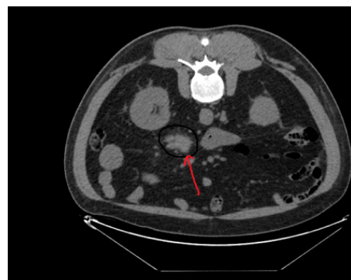
Figure 1. Non-contrast computerised tomography abdomen showing a left retroperitoneal mass in the Gerota's fascia.

Acute tubular necrosis Acute interstitial nephritis Paraneoplastic glomerulonephritis Tumour lysis syndrome